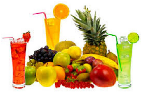
Fruits for Fasting Therapy

On the second week in January, we entered into an Eight Day Fast in an effort to start the year off on a positive note. There was a Broadcasted Prayer each morning at 6:00 A.M. The pastor and different members of our congregation led the prayers. This was definitely a good way to start off the New Year. The Bible tells us in Luke 18:1 that men ought always to pray and not faint. And in Luke 21:36 He says "Watch ye therefore and pray always, that ye may be accounted worthy to escape all these things that shall come to pass, and to stand before the Son of man."