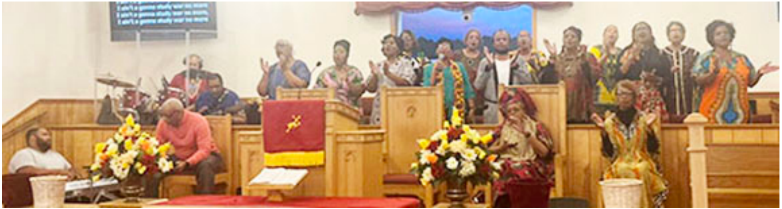
All dressed out for Black History on 4th Sunday in February, 2024